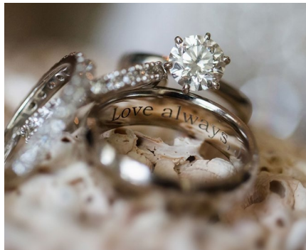
Personalizing and engraving jewelry