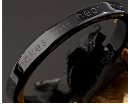
Personalizing and engraving jewelry